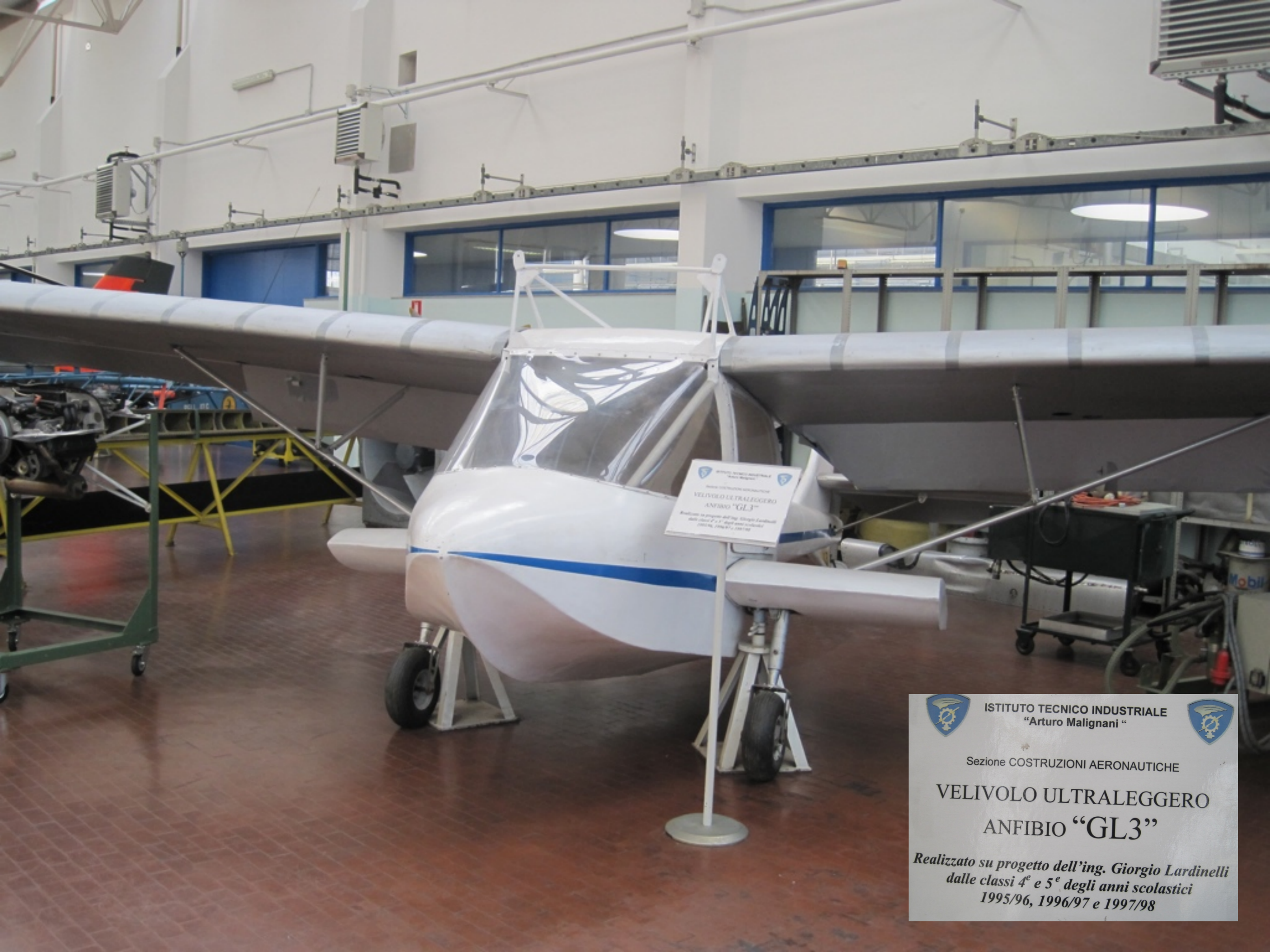
ISTITUTO TECNICO INDUSTRIALE "Arturo Malignani" Sezione COSTRUZIONI AERONAUTICHE VELIVOLO ULTRALEGGERO ANFIBIO "GL3" Realizzato su progetto dell'ing. Giorgio Lardinelli dalle classi 4° e 5° degli anni scolastici 1995/96, 1996/97 e 1997/98